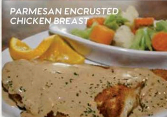
PARMESAN ENCRUSTED CHICKEN BREAST